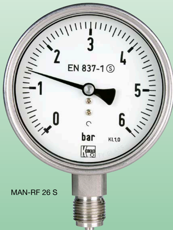
MAN-RF 26 S