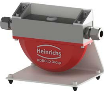
› Desk-Version Measuring pipes pointing downwards