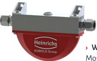
› Wall mounting Mounting with wall brackets