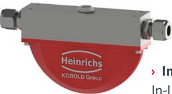
› Inline-Version In-LINE mounting