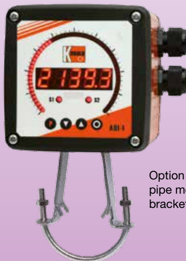
Option pipe mounting bracket