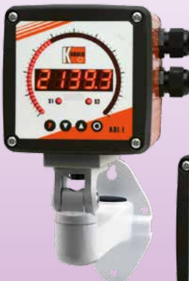
Option wall mounting